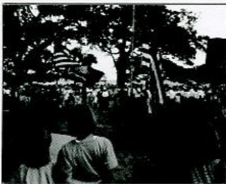
Patriots of all ages watch and salute as the flag is raised.